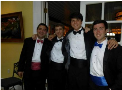
Everyone enjoyed our Formal, held in Savannah, Georgia in April!