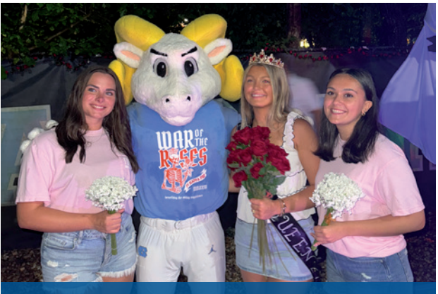
War of the Roses Concert