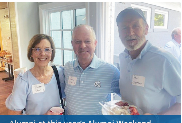
Alumni at this year's Alumni Weekend