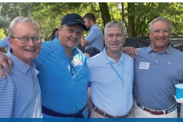
Alumni at this year's Alumni Weekend