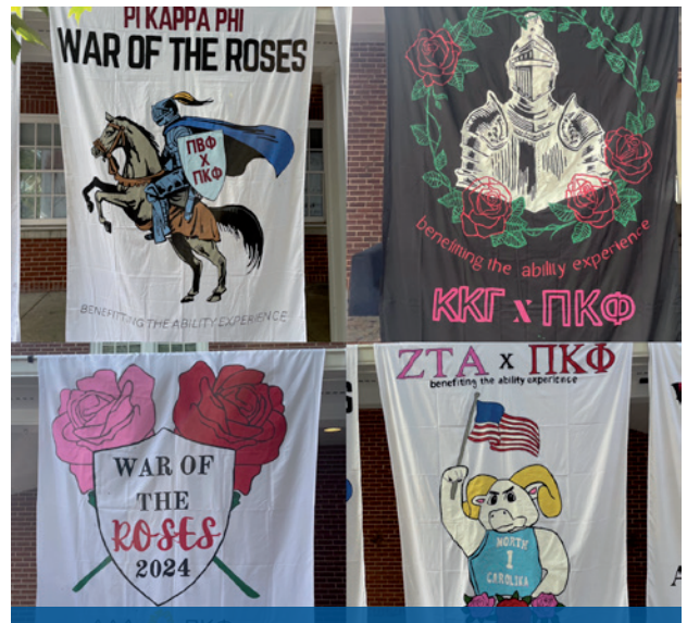
Some of the WOTR sorority banners