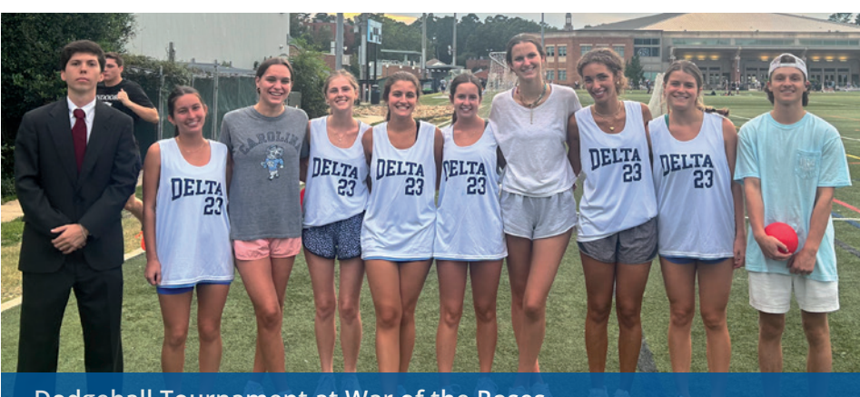
Dodgeball Tournament at War of the Roses

The money we raised will directly benefit thousands of individuals living with disabilities and special needs, making a real difference in their lives. Aligned with our members' strong philanthropic drive, our chapter will continue to grow our efforts, and we cannot be more excited for War of the Roses next year.