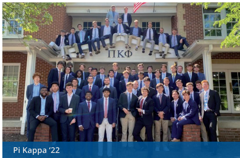
Pi Kappa '22