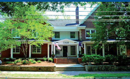
216 East Rosemary Street