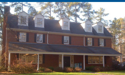
216 Finley Road