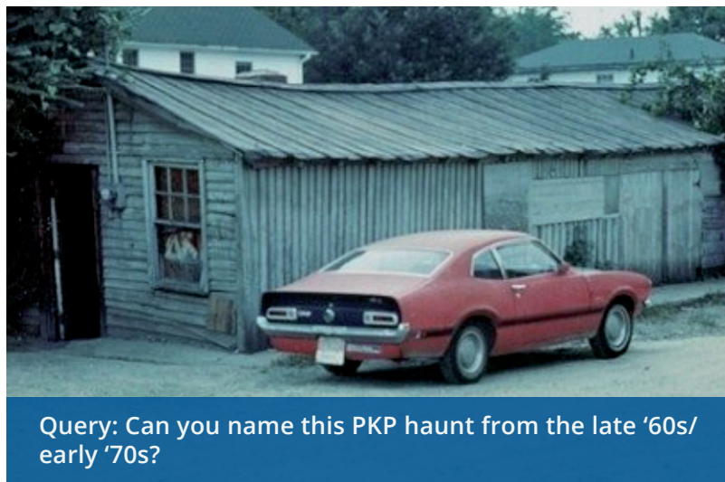
Query: Can you name this PKP haunt from the late '60s/early '70s?