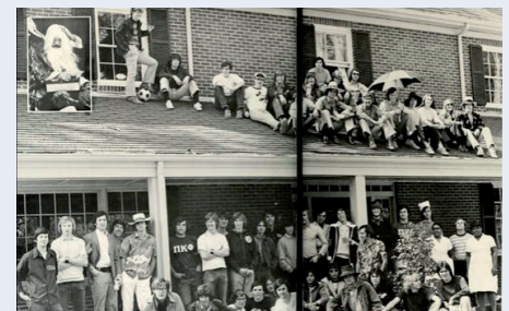
'73 Yackety Yack

Kappa Council owes $212,000 on the mortgage for 216 East Rosemary, which was purchased on June 10, 2011 and will be paid off in February 2025—less than 3 years. We are in good shape financially!